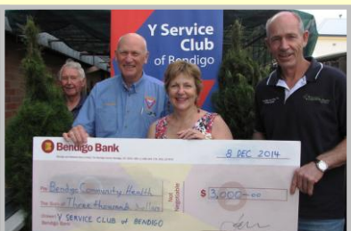
BCHS cheque presentation