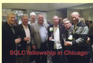
Meetings attended by IPE Wichian

Vision of the YMCA USA to pave more ways of the "Principle of Partnership" implementation.