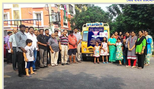
Truck with Relief materials to Jammu & Kashmir