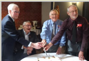
75th Anniversary Bendigo club