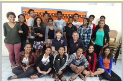
Potential members of New Club group in Suva Fiji