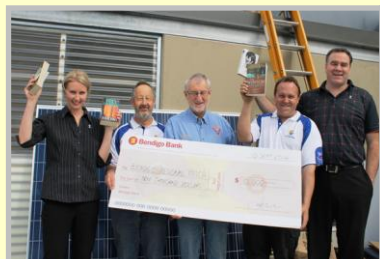
At YMCA House with cheque