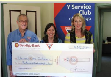
Uniting Care cheque presentation