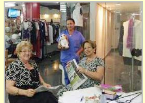
Bazar: Donation of usable clothes, etc for sale for project funds