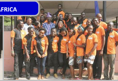
Youth Officers at the Nigeria YMCA Western Zone Youth Conference