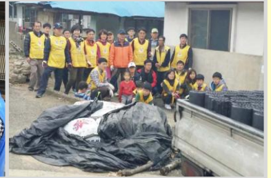
Service of coal for the needy