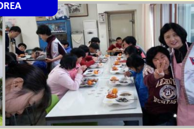
Care for the disabled and the elderly