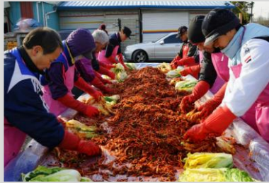
Kimchi Festival for the needy