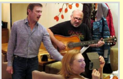
Greetings to new club - Vesna