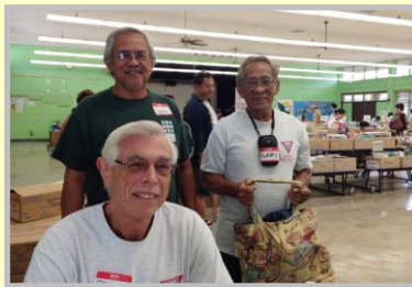
Central Club Hawaii work book fair 2014