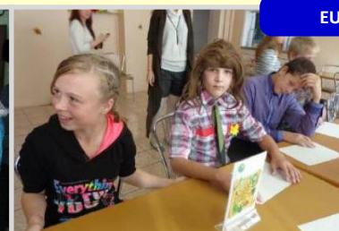
Children of orphanages visited by clubs