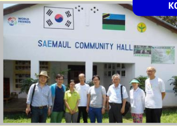
With UAUT Tanzania on establishing Africa Y's Men Town