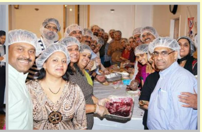
Sandwich preparation for the "Hospitality Too" Soup Kitchen, Long Island club