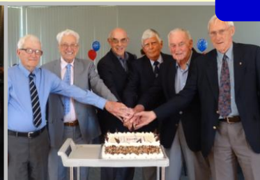
75th Anniversary Bellarat club