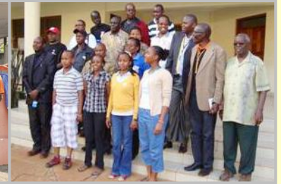
District Training Session in Nairobi Kenya