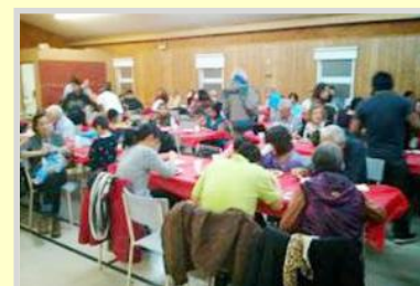
Newcomers Association Dinner.