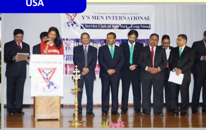
Floral Park & Long Island Christmas 2014