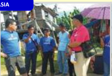
Yolanda Sustainable Water Project in Philippines Region