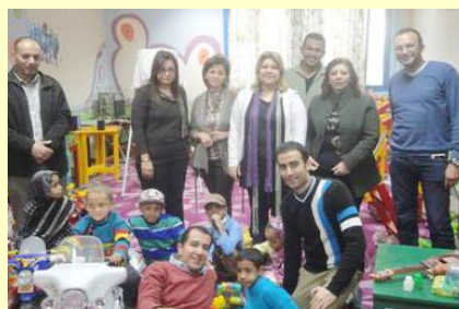
Y's Youth from Egypt giving gifts but more importantly their time to children.