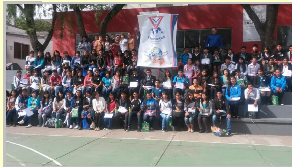
Hounoring the best public high school graduates of Cochabamba