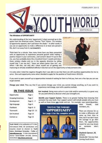
Youth World Edition 63 is out!