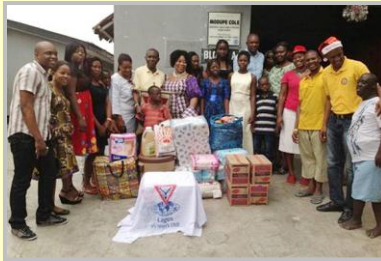
Visitation to School for the Handicapped with needed supplies