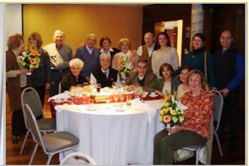
Open night celebration of the Anniversary of the Uruguay Club