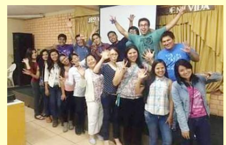
Y's Men Club formulated by youth in Latin America