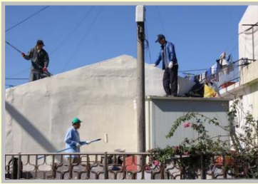
Repairing the house for the elderly living alone at home