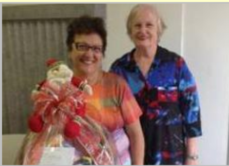
Donation of a Christmas basket