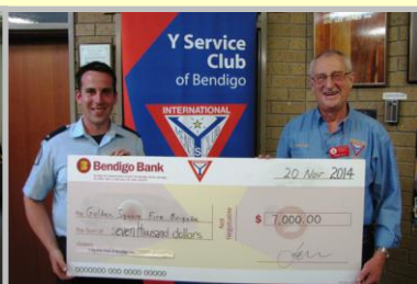
Golden Square CFA cheque presentation