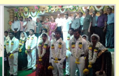
Community Service Projects: Inauguration of Y's Village (14 Homes for homeless), Monthly assistance to financially backwards students, Carpet for students to sit on floor in a poor school, Community marriage arranged by Region