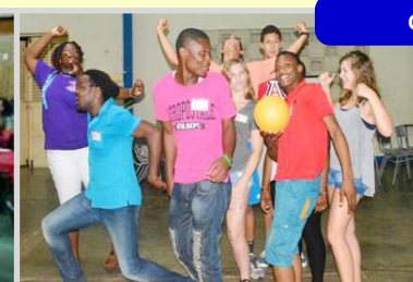
Activities from 'Equipping Global Leaders' Conference