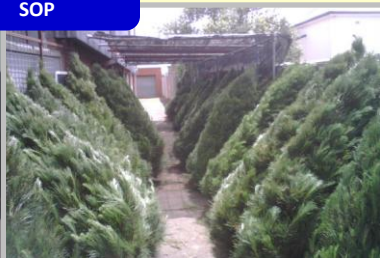
Fund raising - Christmas Trees for sale