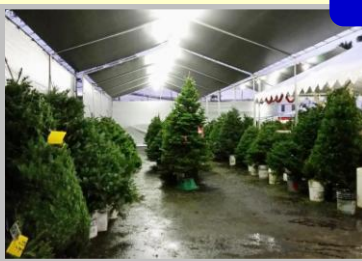
Hilo Tree Sales 2014