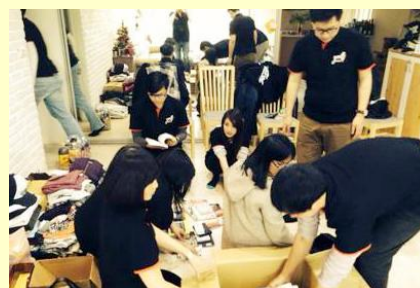
The youth of Taipei working together to make some deliveries