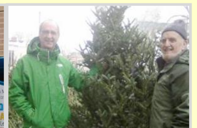
Christmas tree sales