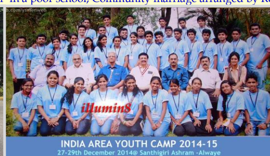
Youth activities: Area Youth camp, Y Care for blind children