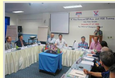
Asia & Korea Area Joint RDE Training with SOP Area