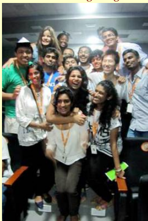
Some bonds formulated at the IYC 2014 are forever